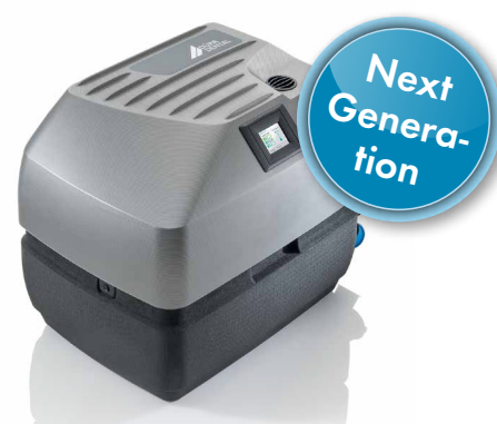
Tyscor VS 4 for 4 operators