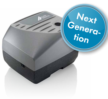
Tyscor VS 1 for 1 operator Tyscor VS 2 for 2 operators