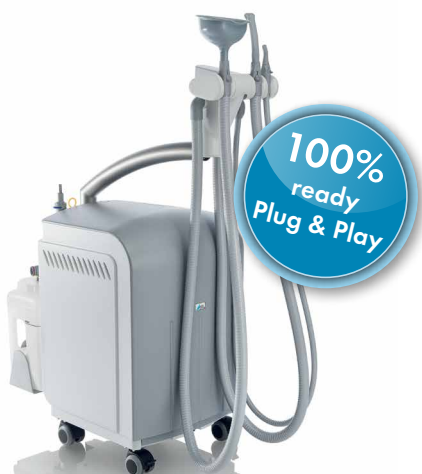
Variosuc: mobile system for 1 operator

If the spray mist is not correctly aspirated within the patient's mouth, aerosol will be formed, which spreads over a radius of several meters and presents a high risk of infection for the practice team. Contaminated aerosol can be detected in ambient air for up to 30 minutes (see also: Drisko et al., 2000, Bennet et al., 2000).