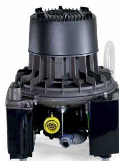
VS 300 S for 1 operator