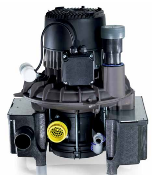
VS 600 for 2 operators