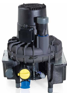
VS 900 S for 3 operators VS 1200 S for 4 operators

*Measurement results from internal study, September 2020, Dürr Dental